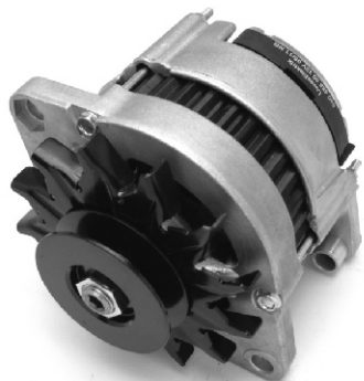
LEA0596 14V / 55A

Used On: Fiat & Lancia 1.8 & 2.0 Engines 1975-82 Replaces: Bosch 0-120-489-020, -134, -135, -141, -170, -541, -542, -641, -642, -752, -753 Fiat & Lancia 4335424, 4424546, 61664307, 82300531