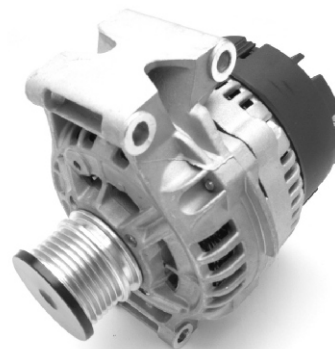
LEA0634 14V / 90A

Used On: Opel Astra, Signum, Vectra & Zafira 1.9 CDTi Engines 2004-> Replaces: Denso 102211-8660, -8661 Opel 13117236, 13153236