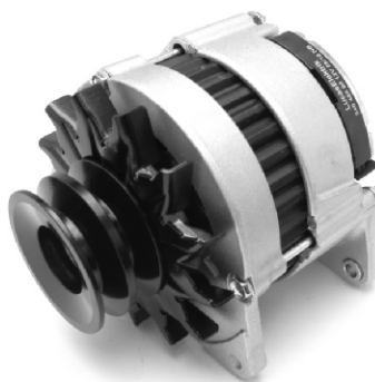
LEA0642 14V / 80A

Used On: Land Rover Defender, Discovery & Range Rover 2.5 Diesel Engines 1989-02 Replaces: Lucas 54022459 Land Rover YLE10075, YLE10113