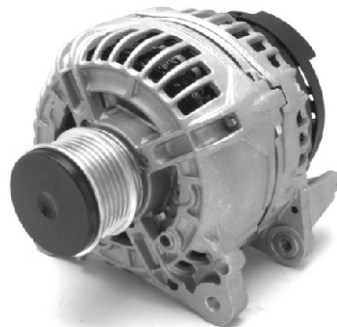
LEA0614 14V / 120A

Used On: Fiat & Lancia 1.8 & 2.0 Engines 1975-82 Replaces: Bosch 0-120-489-020, -134, -135, -141, -170, -541, -542, -641, -642, -752, -753 Fiat & Lancia 4335424, 4424546, 61664307, 82300531