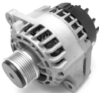
LEA0633 14V / 130A

Used On: Audi, Seat, Skoda & VW 1.6 and 1.8T also 1.9 TDI Engines 1996-06 Replaces: Bosch 0-124-515-117, -121, -124, -125 VAG 028-903-030A, 038-903-018Q, -018QX, -024F