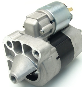
LES0302 12V / 0.85kW

CW / 10 Teeth Used On: Renault 9,11,19, 21, Super, Clio, Megane Kangoo, Laguna & Espace 1987->> Replaces: Bosch 0-001-107-047 Renault 7700105080, 7700865719