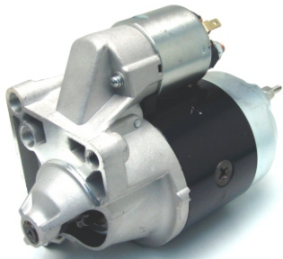
LES0299 12V / 1.0kW

CW / 9 Teeth Used On: Renault 9, 11, 21 & Super 1984-1993 Replaces: Paris Rhone D9E39, D9E76 Renault 7700703490, 7701351027, 7701499467