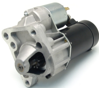
LES0301 12V / 1.1kW

CW / 15 Teeth Used On: Mitsubishi Various Applications Replaces: Mitsubishi M2T50381, M2T50391 Opel 9160556, Renault 7700300522, 7700313447