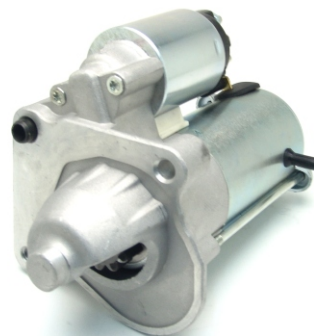
LES0304 12V / 1.2kW

CW / 10 Teeth Used On: Toyota Hilux, Land Crusier, 4 Runner 1996->> Replaces: Denso 228000-5020, 228000-5021 Toyota 28100-67050