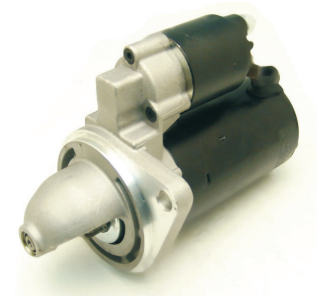
LES0410 12V / 1.4kW

CW / 11 Theeth Used on: DAF CF75.250 2001-2007 DAF CF75.310, CF75.360 2006->> Replaces: Bosch 0-001-263-003, -004, 054 Bosch 0-001-231-040 DAF 1633811, 1633811R, 1826120, 1826120R, 1956092