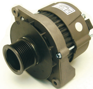
LEA0772 28V / 55A

Used on: Agco Challenger MT345B 3.3D Massey Ferguson MF3625 Replaces: Iskra AAK3354, IA0983 Massey Ferguson 3823653M1