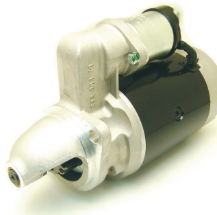
LES0404 14V / 3.0kW

Used on: Massey Ferguson MF611, 6120, 6130 1992-1997 Massey Ferguson MF6170, 6180, 6190 1996->> Massey Ferguson MF6235, 6245, 6255, 6270 1999-2000 Replaces: Iskra 11.203.388 Massey Ferguson 3821976M92, -M91 3821978M91, 4271312M91 & 3788017M91